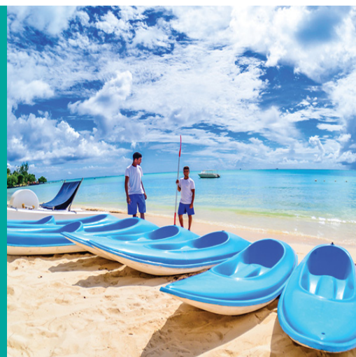
Boathouse - Opens from 09:00 till 17:00

**Above activities are subject to weather conditions**